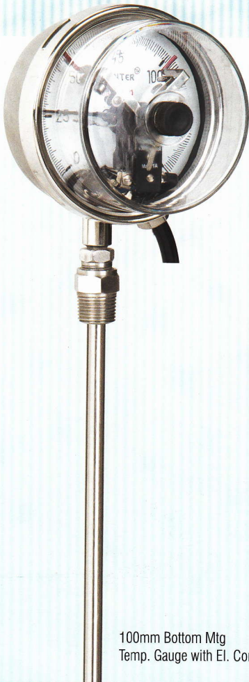
100mm Bottom Mtg Temp. Gauge with El. Contact

"POINTER" Electric contact gauges are suitable for the measurement & control of line pressure / Temperature by switching 'ON & OFF' electrical equipment which eliminate the need of separate switches for equipment.