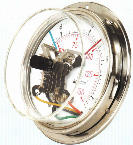
150mm Panel Mounting Pressure Gauge with El. Contact